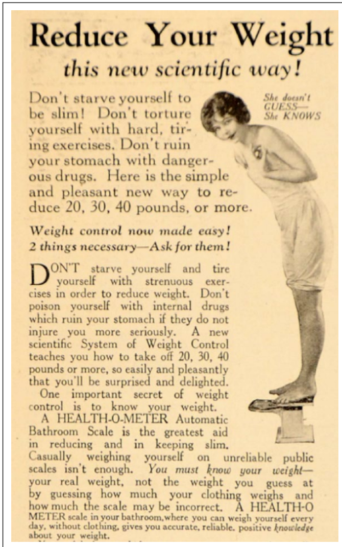
Figure 4. Advertisement for the Health-O-Meter weight scale, 1925.

This relationship between numerical accuracy, truth and self-knowledge is similarly operationalized by wearable devices, despite the quality of the metrics about activity and sleep being nascent and uncertain, and the data often inconsistent. Nonetheless, the claims of accuracy remain, as a powerful articulation of the belief that the better the data, the better the quality of self-knowledge, and so a 'better human' is created.