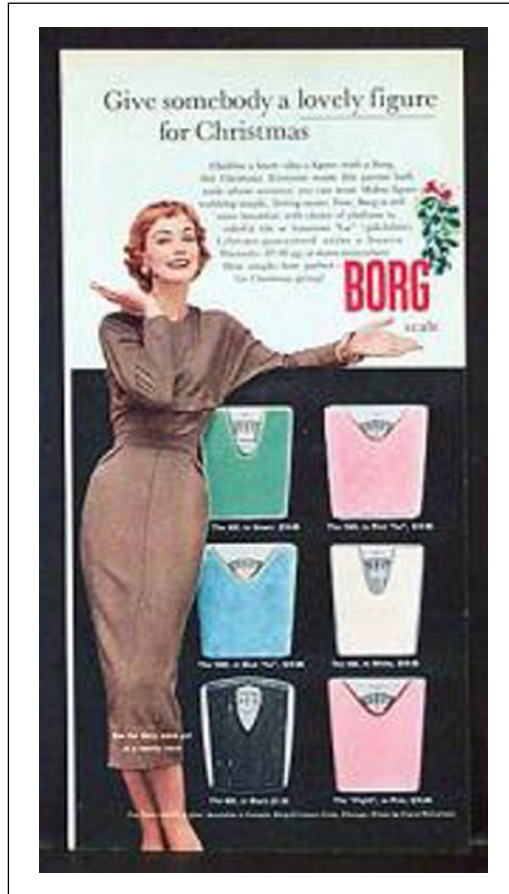
Figure 7. A holiday ad from Borg, marketing its weight scale.

wearables? Much depends on what data they use and how they define the 'normal' healthy individual, yet research on exercise, sleep, diet and health changes constantly, and this contextual 'norm-setting' data used by an analytics platform is rarely transparent.