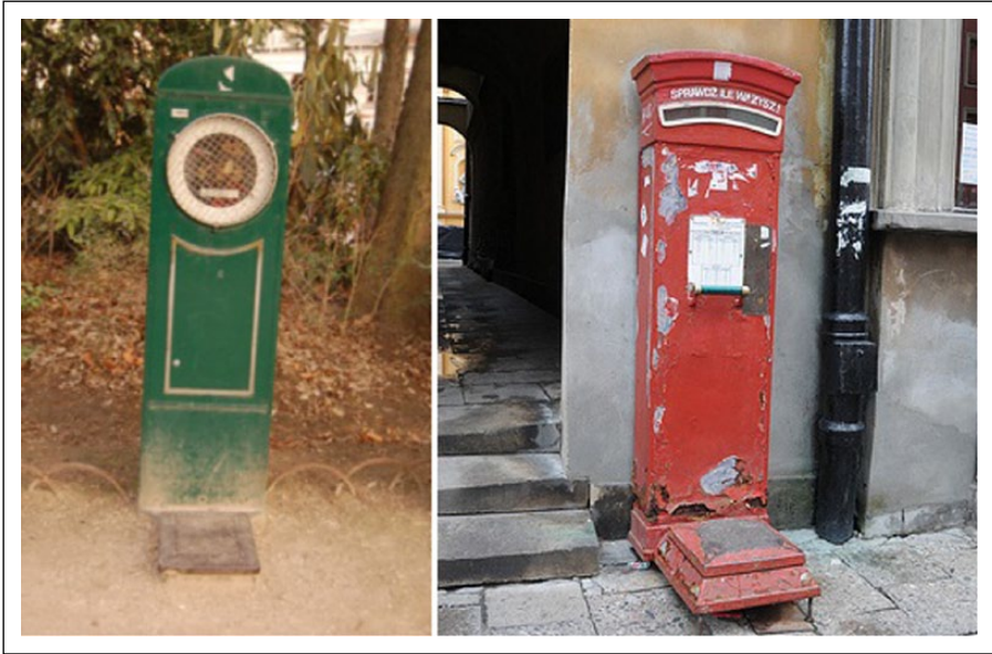
Figure 1. Public scales from the late 1880s in contemporary Paris.

emerges between the slogans used for the weight scale and the wearable: the device offers self-knowledge, and through that a new sense of control over the body, which leads to a better life.